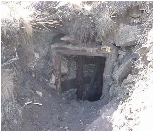
Figure 2-1. Unprotected mine portal.