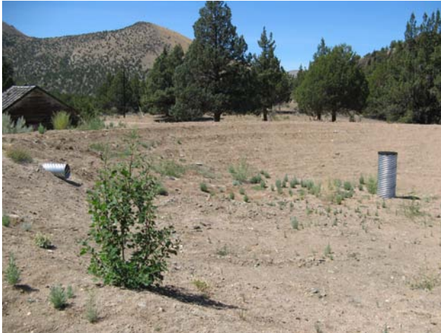
Figure 2-3. Storm-water retention basin.