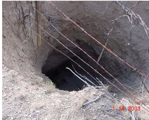
Figure 2-2. Dangerous open glory hole at head works.

The remedial action consisted of the following elements: