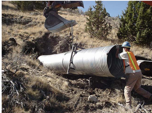
Figure 2-4. Installation of bat gate in mine portal.

Capping includes placement of alluvial sediments over a limited area associated with the D-tube furnace that had been documented to have elevated concentrations of mercury. Two settling ponds were also constructed for site storm-water retention. These retention basins were designed to eliminate any off-site migration of mine tailings.