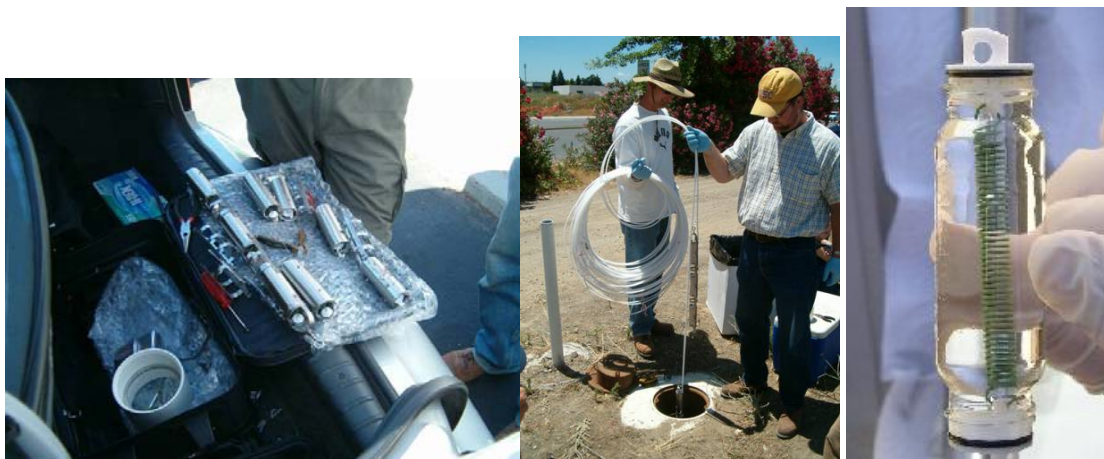
FIGURE 2.5 STANDARD SNAP SAMPLER™ NO-PURGE SAMPLER DEMONSTRATION MCCLELLAN AFB, CALIFORNIA

Up to three Snap Samplers™ can be connected in series with a single suspension/trigger cable. The suspension/trigger cable consists of a 1/32-inch-diameter stainless steel wire rope within ¼-inch HDPE tubing. The HDPE tubing attaches to the samplers and the wire rope attaches to the release mechanism of the sampler. The samplers are lowered into the well to a predetermined depth using the suspension/trigger cable. The suspension/trigger cable is secured at the surface at a well-head docking station that does not interfere with well-head locks or water level measuring devices.