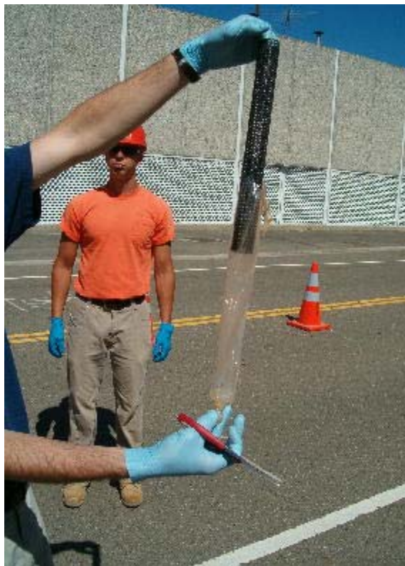
FIGURE 2.4 STANDARD RCS NO-PURGE SAMPLER DEMONSTRATION MCCLELLAN AFB, CALIFORNIA