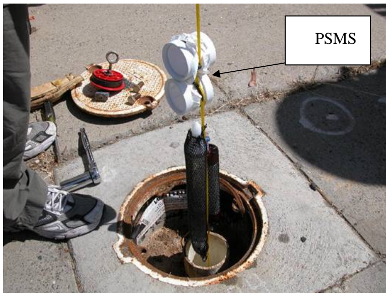
FIGURE 2.3 STANDARD PSMS NO-PURGE SAMPLER DEMONSTRATION MCCLELLAN AFB, CALIFORNIA

membrane was positioned orthogonally to horizontal groundwater flow. Due to the lack of field- or bench-scale testing of PsMSs, potential advantages or disadvantages of this sampler have not been quantified.