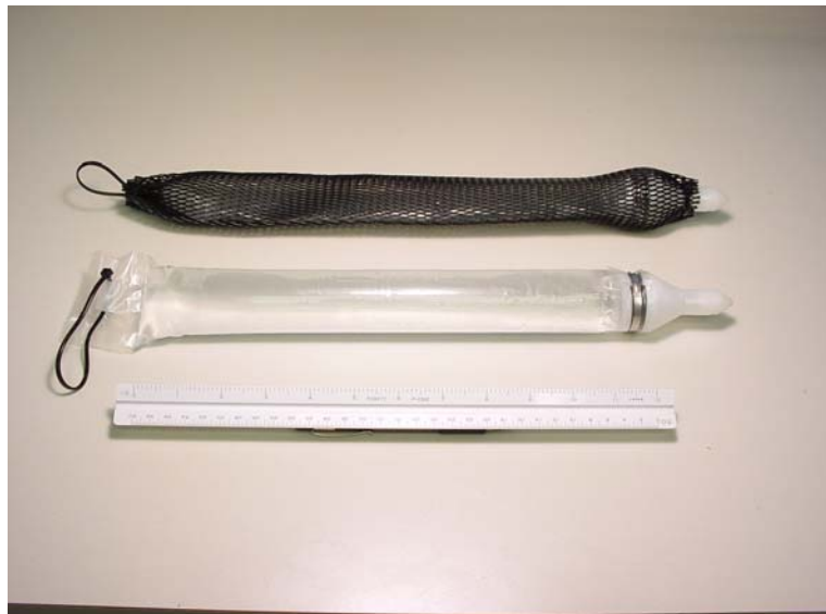
FIGURE 2.1 STANDARD PDBS NO-PURGE SAMPLER DEMONSTRATION MCCLELLAN AFB, CALIFORNIA

Depending on the hydrogeologic characteristics of the aquifer, the diffusion samplers can reach equilibrium within 3 to 4 days (Vroblesky, 2001). Groundwater samples collected using the diffusion samplers are thought to be representative of water present within the well during the previous 24 to 72 hours. However, the recommended minimum equilibration time for water temperatures above 10 degrees Celsius (°C) is two weeks (ITRC, 2004).