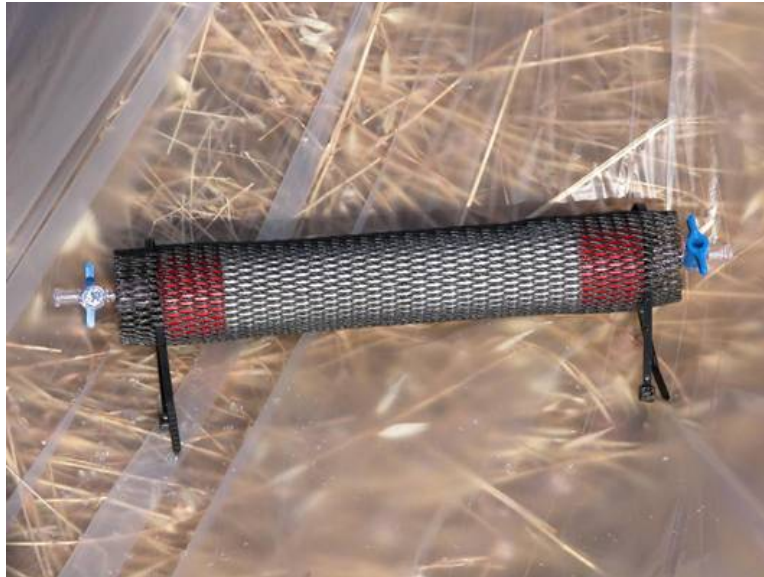
FIGURE 2.2 STANDARD RPPS NO-PURGE SAMPLER DEMONSTRATION MCCLELLAN AFB, CALIFORNIA