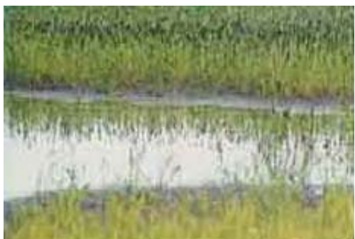
(Left) Figure 7-3. The Republic Wetlands Preserve is 2,300 acres of wildlife habitat, including about 600 acres of newly created wetlands. (Above) Figure 7-4. The preserve was developed on the mine tailings and reuse water basins of the former Republic iron ore mine.

Recently there has been interest in creating wetlands over mine waste to control water quality problems. If tailings can be kept permanently submerged or anoxic, oxidation of the tailings and subsequent water quality problems are minimized. Water covers are now the most accepted method of controlling water quality problems relating to mine tailings in Canada. Pilot studies have demonstrated that establishing a wetland with permanently saturated soils is also effective in preventing acidification. Establishing a wetland over such areas when the mining is completed could provide not only successful reclamation but also wildlife habitat (Eger et al. 2000).