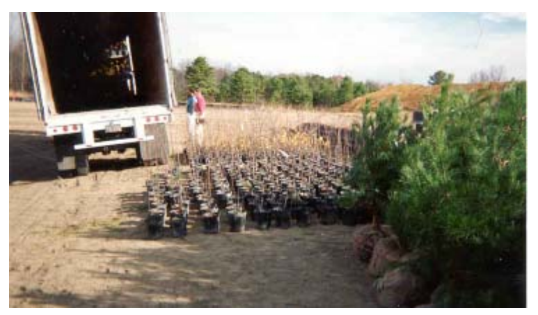
Figure 4-1. Delivering plants for a mitigation project.

The list of plants and their placement at the site should be considered on a site-specific basis in consultation with appropriate state and/or federal regulatory agencies responsible for approving