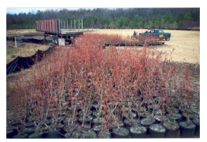
Figure 5-4. Plant staging.

All plants should be delivered and staged (Figure 5-4) on site prior to planting. Upon delivery, plants should be inspected to ensure that they are in good health, are not potbound, and are the correct species and form. The holes dug for potted species should be sufficiently larger in circumference than the pot so that loose soil can be filled in around the plant. For most species, the depth of the hole should equal the depth of the plant container. Depending upon the hydraulics of the site during planting activities, the plants may need to be watered following their installation. Plants should not be removed from containers until immediately before