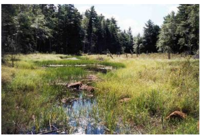
Figure 1-1. Example of an emergent marsh (courtesy Charles Harman, AMEC Earth & Environmental).

The functions of a wetland and the associated values depend on a complex set of relationships between the wetland and the other ecosystems in the watershed. A watershed is a geographic area in which water, sediments, and dissolved materials drain from higher elevations to a common low-lying outlet point on a larger stream, lake, underlying aquifer, or estuary. The combination of shallow water, high nutrient levels, and productivity is ideal for the development of organisms that form the foundation of the food chain. Birds and mammals rely on wetlands for food, water,