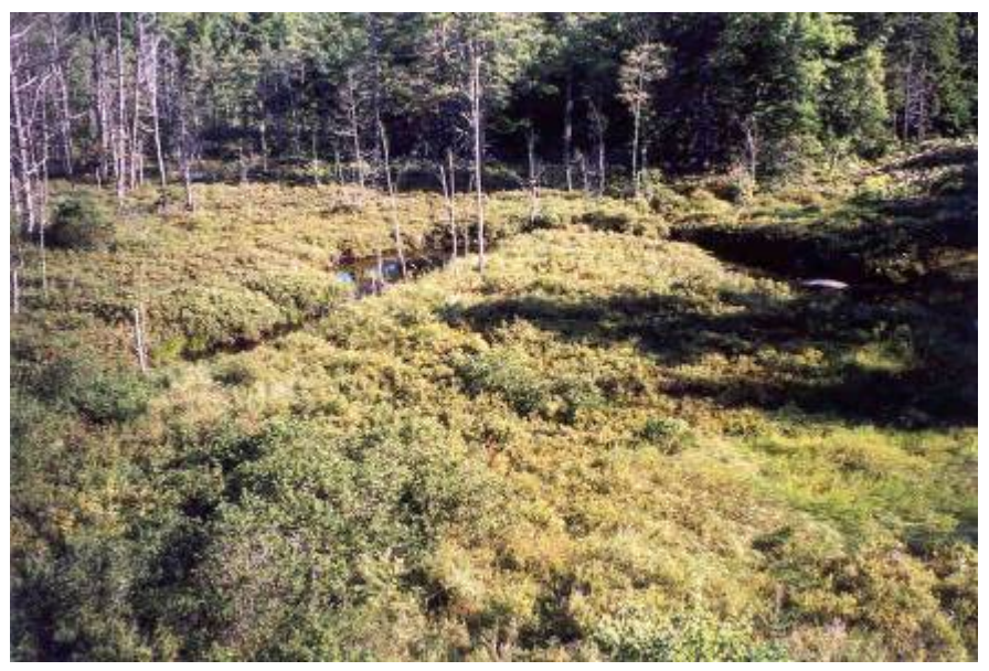
Figure 1-4. Example of a bog.

Over time, many feet of acidic peat deposits build The uniquely up. demanding physical and chemical characteristics of bogs result in plant and communities, animal which demonstrate special adaptations to low nutrient levels. saturated conditions, acidic and waters.