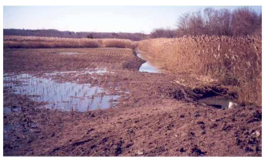
Figure 3-1. Mitigation site planting.

Detailed characterization of the wetlands should be conducted field in the The characterization of the wetland can be conducted on either a qualitative or a quantitative basis, depending on the size of the wetlands, the scope of the anticipated mitigation. and permit requirements requested by the associated state or federal agency. In general, the wetland characterization focuses on the evaluation of the three basic parameters used wetlands delineation, for vegetation. hydrology, and