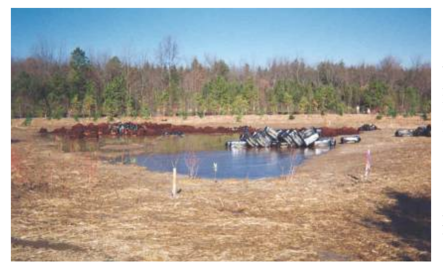
Figure 1-2. Wetlands creation in progress (courtesy Charles Harman, AMEC Earth & Environmental).

States. The CWA's objective is to restore and maintain the physical, chemical. and biological integrity of the waters (Federal nation's Water Pollution Control Act, Public Law 92-500). The CWA charges the U.S. Army Engineers Corps of (USACE), or a delegated state, to oversee and provide protection of U.S. waters through this or equivalent state laws. Wetlands are included as waters of the United States. Since wetlands improve water