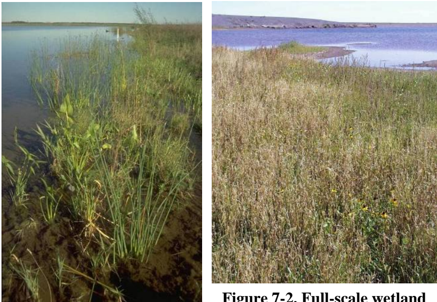
Figure 7-1. Test plot, Keewatin, Nashwauk, Minnesota.

However, tailings are infertile. contain little organic material, and do not provide a suitable substrate to support a diverse vegetative community of desirable wetland species. Tests conducted in Minnesota have shown that. by applying various substrates, vegetative cover and biomass were increased and wetland species were present areas with in suitable hydrology (Eger et al. 2000). Dredge material from Lake Superior was particularly successful in improving vegetation and currently is a waste product