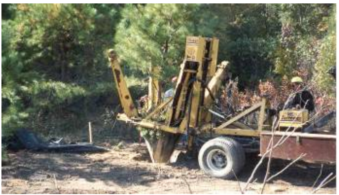
Figure 5-1. Planting equipment (courtesy Charles Harman, AMEC Earth & Environmental, Inc.).

The construction process (Figure 5-1) is a phased activity that begins with site preparation finishes and with demobilizing staged equipment and allowing for monitoring to occur. The following sections outline some of the salient aspects of the construction process; however, they are not intended to serve as a replacement for standard construction practices that are legally overseen at a given site. Dialog with the construction engineer must be sustained during the design phase to ensure that all aspects and concerns are addressed.