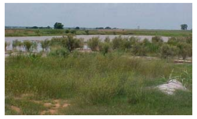
Figure 7-5. Royce Kelley Pit #2 in McClain County, Oklahoma (courtesy Jim Shirazi, Oklahoma Department of Agriculture).

When wells are drilled for the oil and gas industry, a drilling fluid ("drilling mud"), typically bentonite and water, is required. During drilling, a sump or pit is constructed and the fluids are recirculated through the pit. Solids from the drilling process settle in the pit, and the fluid is reused in the drilling. At the end of drilling the spent fluid must generally be removed. The fluids are usually taken to large off-site disposal facilities, which range from 2 to as much as 4 acres and can contain more than one million gallons of wastewater. The clay settling from the wastewater forms an impervious layer in the bottom of the pond and reduces seepage loss. The