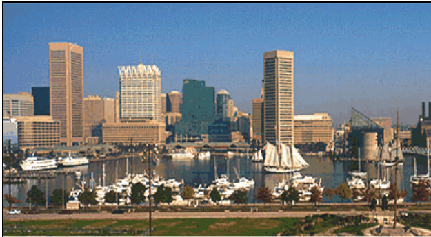
The Baltimore Skyline